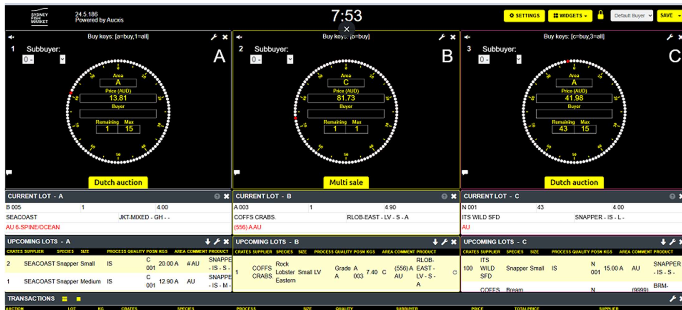
Multi Clock view

This window can take many forms depending on the 'widgets' you choose to display. It is possible to have one window that can toggle between all three clocks, or you can have all 3 clocks show in one window.